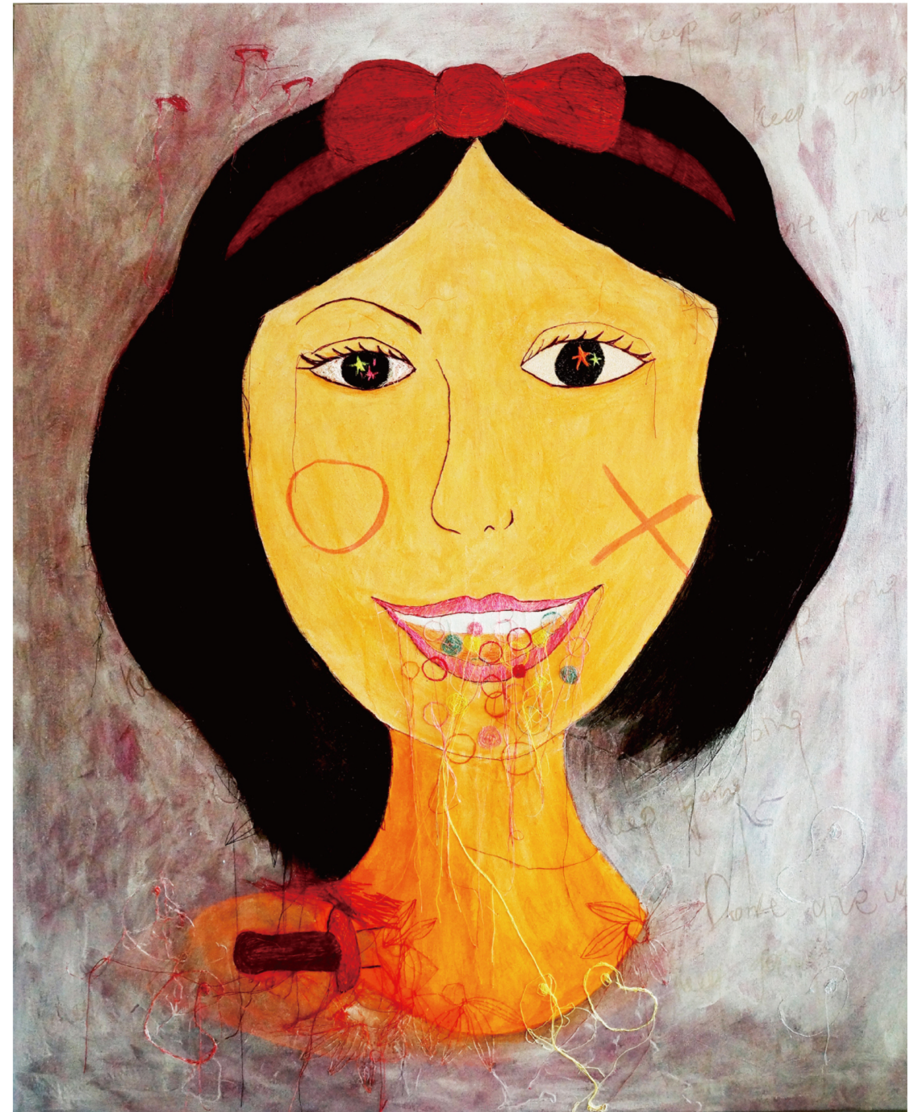
不完美的完美-4 彩色繡線·毛線·壓克力顏料·畫布 Perfect Imperfection-4 Embroidery, Wool and Acrylic on Canvas 155x128 cm 2014