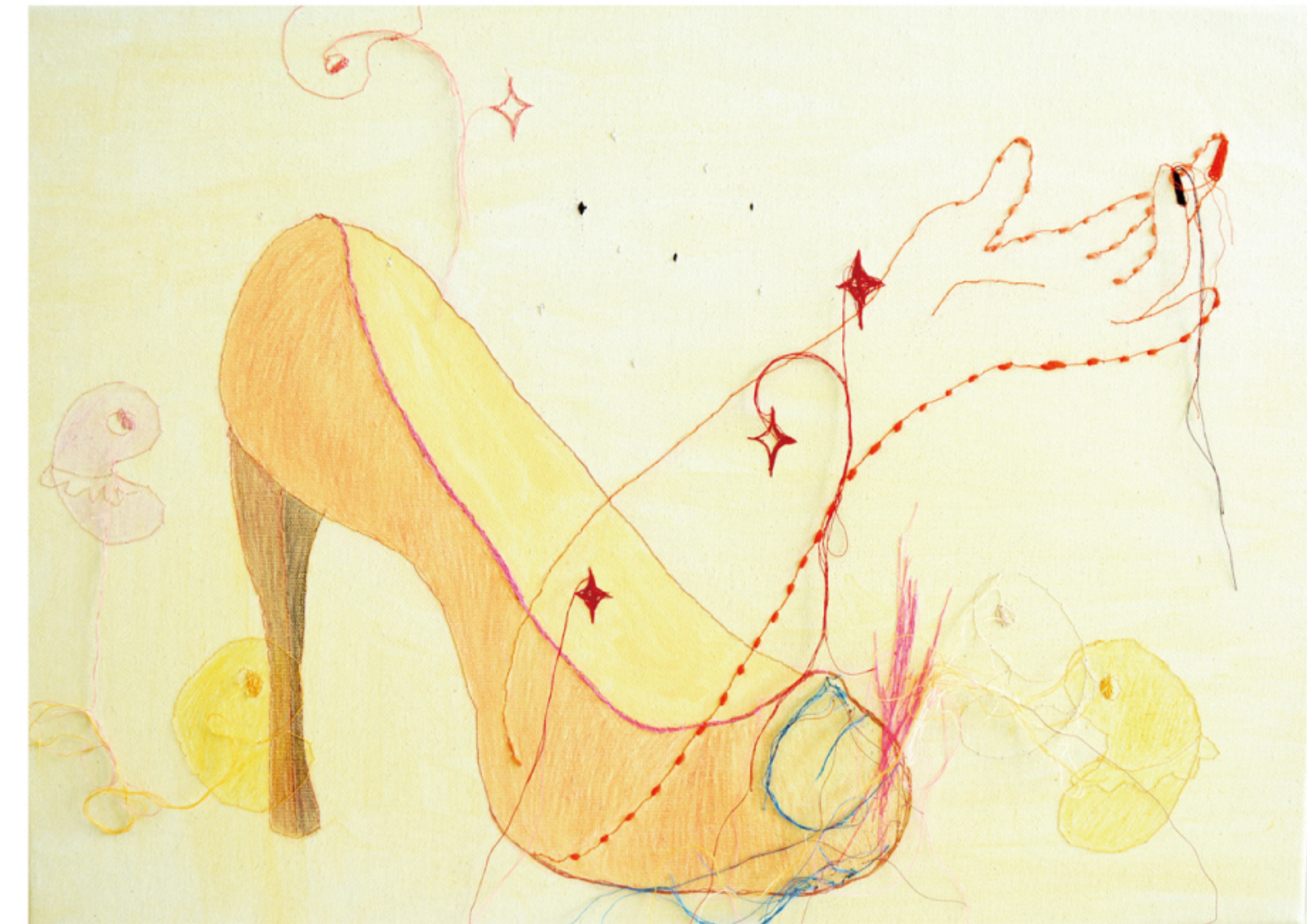
隱藏的力量-1 壓克力顏料、彩色繡線、畫布 The Hidden Power-1 Acrylic, Eembroidery on Canvas 60x43 cm 2013