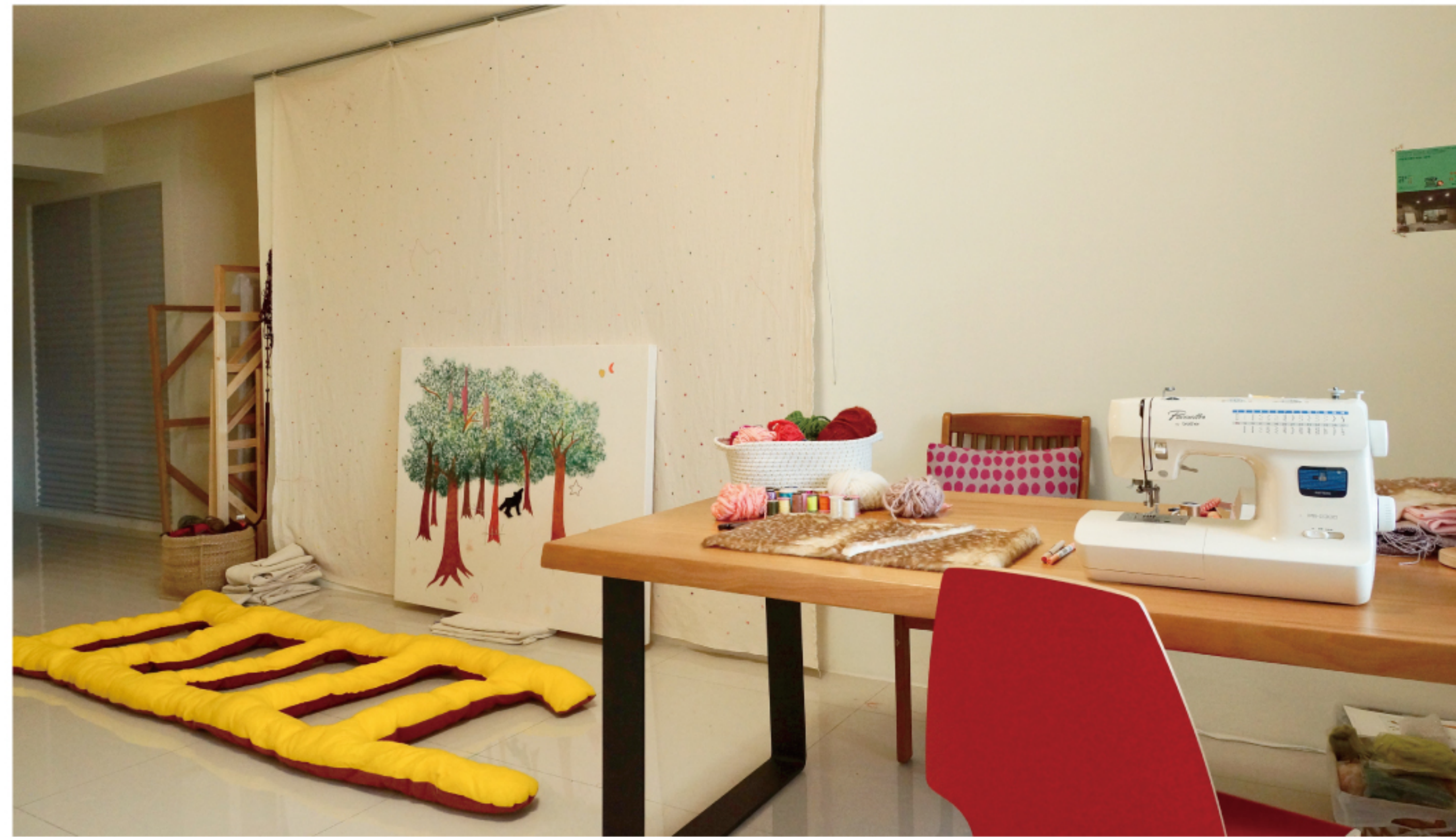
藝術家工作室 Artist Studio

one of the jurors and quite liked her works. Accordingly, she was invited to participate in All You Need Is LOVE: From Chagall to Kusama and Hatsune Miku, a group exhibition for the 10th anniversary of the Mori Art Museum.